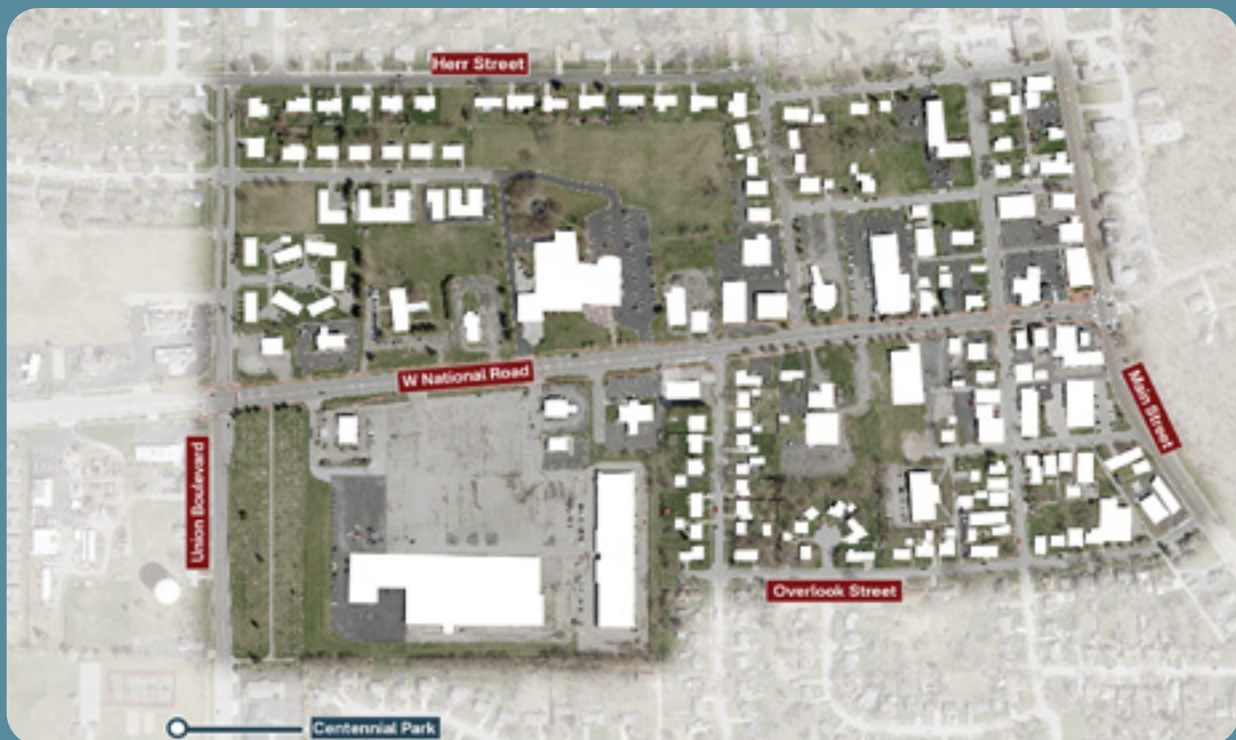
Proposed study area for the downtown master plan